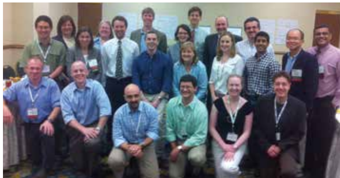
2012-2013 ASPHO Program Committee